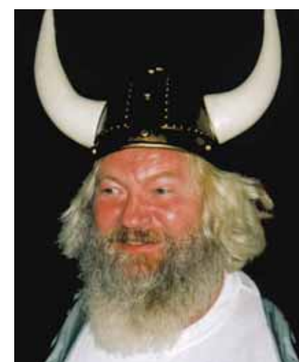
Taggart, several TV roles - big brother in a programme about George Orwell, played the Pilot of the Lockerbie 747 in a documentary. Various adverts for Stagecoach,

"Acting - well I've been in Monarch of the Glen, was one of Bradd Pitts 'spartans', been in Rebus and