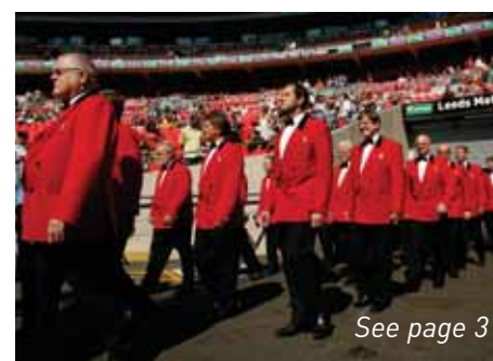
See page 3

Quality not quantity is key to professional era