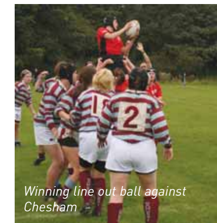
Winning line out ball against Chesham