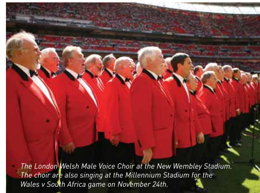
The London Welsh Male Voice Choir at the New Wembley Stadium. The choir are also singing at the Millennium Stadium for the Wales v South Africa game on November 24th.

On one of the few scorching hot days of the summer the choir sang to an enthusiastic crowd and delighted the Dragon supporters by performing the Catalan National Anthem before singing the most famous of all Cup Final Hymns, Abide With Me.